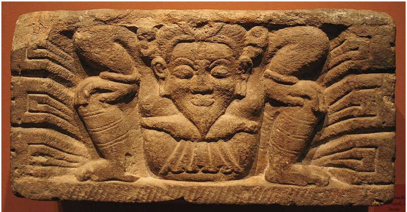
Image Credits: Yaksha Relief ; Nepal, Kathmandu Valley, possibly Deopatan; Licchavi period; circa 8th–9th century; In the public domain