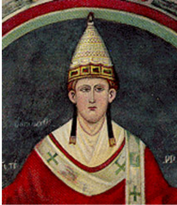
Pope Innozenz III. Fresco at the cloister Sacro Speco, about 1219

The two-dimensional work of art depicted in this image is in the public domain in the United States and in those countries with a copyright term of life of the author plus 100 years. This photograph of the work is also in the public domain in the United States (see Bridgeman Art Library v. Corel Corp. ).