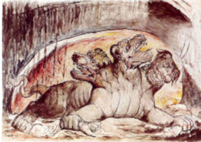
Cerberus, by William Blake

The two-dimensional work of art depicted in this image is in the public domain in the United States and in those countries with a copyright term of life of the author plus 100 years. This photograph of the work is also in the public domain in the United States (see Bridgeman Art Library v. Corel Corp. ).